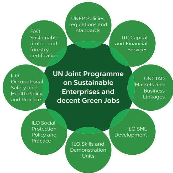
Figure 1: Programme Interventions

by increasing awareness, coverage and compliance to social security standards. The brief discusses how the process and results achieved in terms of access to social protection have contributed to the overall programme objectives from the perspective of enterprise development and creation of new green and decent jobs.